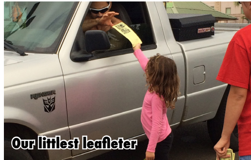
Our littlest leafleter