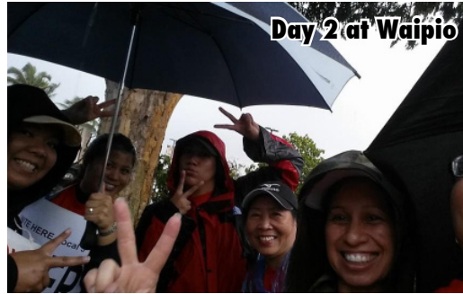
Day 2 at Waipio