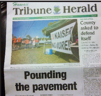
Front page of the paper!