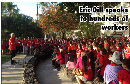
Eric Gill speaks to hundreds of workers