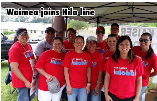
Waimea joins Hilo line