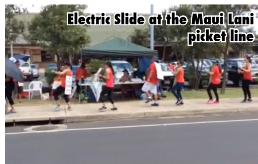
Electric Slide at the Maui Lani picket line