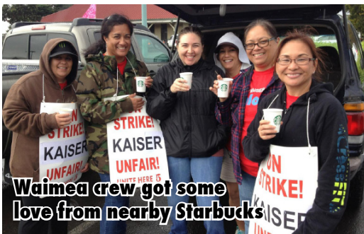
Waimea crew got some love from nearby Starbucks