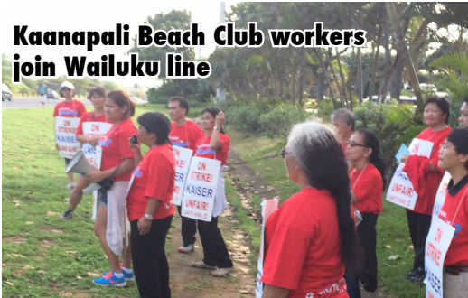
Kaanapali Beach Club workers join Wailuku line