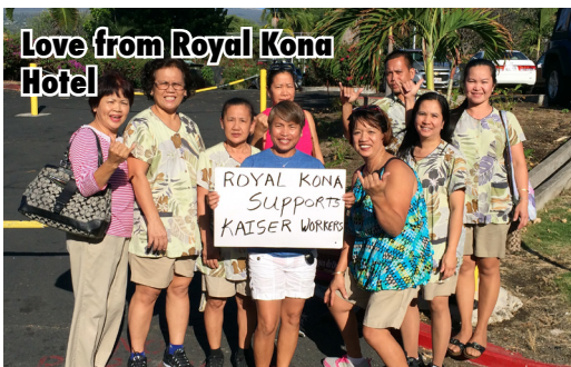
Love from Royal Kona Hotel