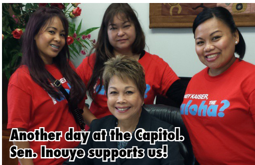
Another day at the Capitol. Sen. Inouye supports us!