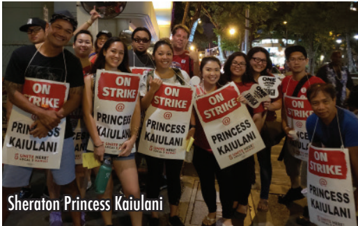
Sheraton Princess Kaiulani