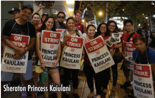
Sheraton Princess Kaiulani