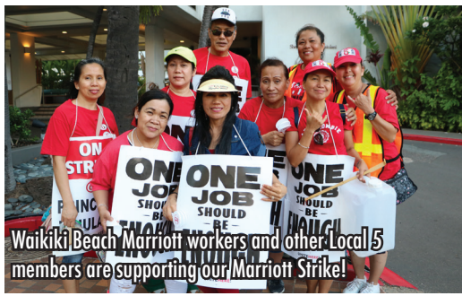
Waikiki Beach Marriott workers and other Local 5 members are supporting our Marriott Strike!