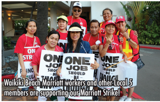
Waikiki Beach Marriott workers and other Local 5 members are supporting our Marriott Strike!