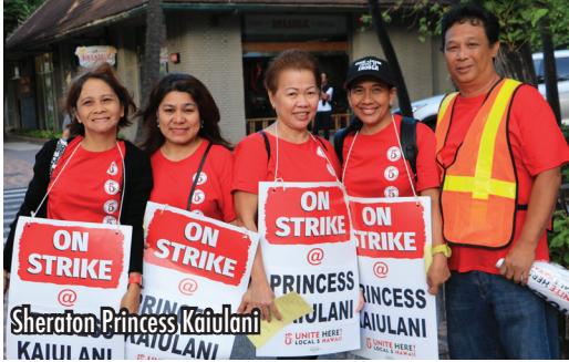
Sheraton Princess Kaiulani