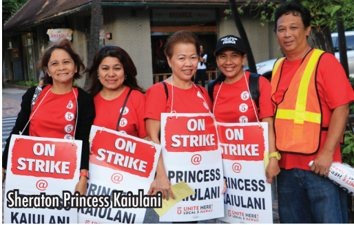
Sheraton Princess Kaiulani