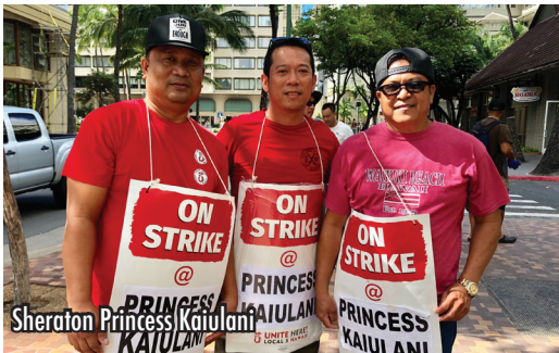
Sheraton Princess Kaiulani