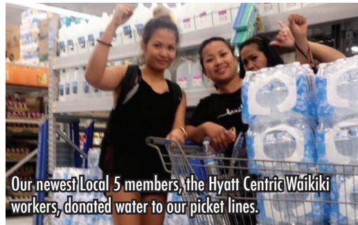
Our newest Local 5 members, the Hyatt Centric Waikiki workers, donated water to our picket lines.