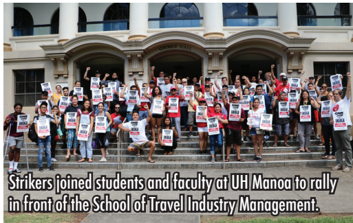
Strikers joined students and faculty at UH Manoa to rally in front of the School of Travel Industry Management.