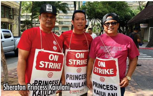
Sheraton Princess Kaiulani