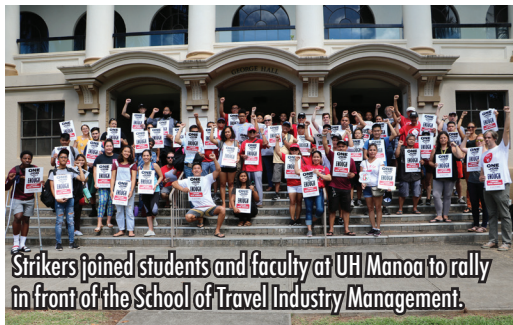
Strikers joined students and faculty at UH Manoa to rally in front of the School of Travel Industry Management.