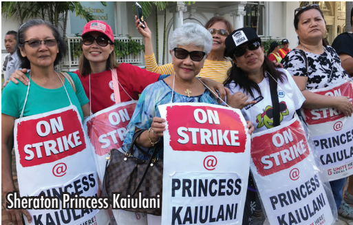
Sheraton Princess Kaiulani