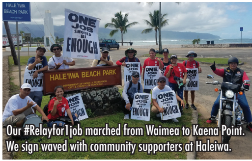
Our #Relayfor1job marched from Waimea to Kaena Point. We sign waved with community supporters at Haleiwa.