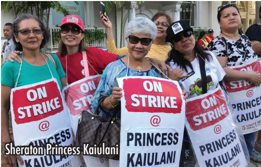
Sheraton Princess Kaiulani