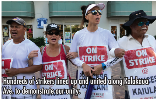
Hundreds of strikers lined up and united along Kalakaua Ave. to demonstrate our unity.