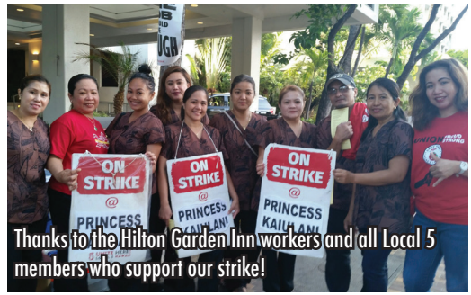
Thanks to the Hilton Garden Inn workers and all Local 5 members who support our strike!