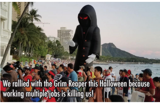
We rallied with the Grim Reaper this Halloween because working multiple jobs is killing us!