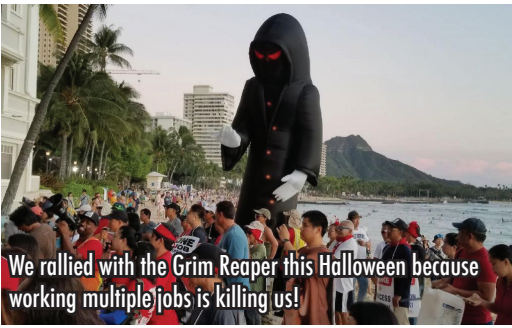
We rallied with the Grim Reaper this Halloween because working multiple jobs is killing us!