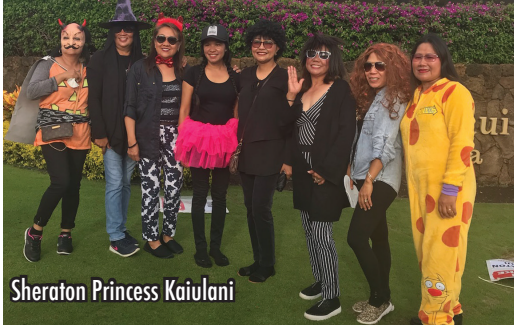
Sheraton Princess Kaiulani