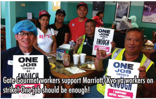
Gate Couriers support Marriott/Kyo-yo workers on strike! One job should be enough!