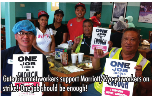
Gate Couriers support Marriott/Kyo-yo workers on strike! One job should be enough!