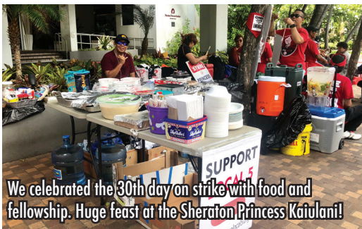
We celebrated the 30th day on strike with food and fellowship. Huge feast at the Sheraton Princess Kaiulani!