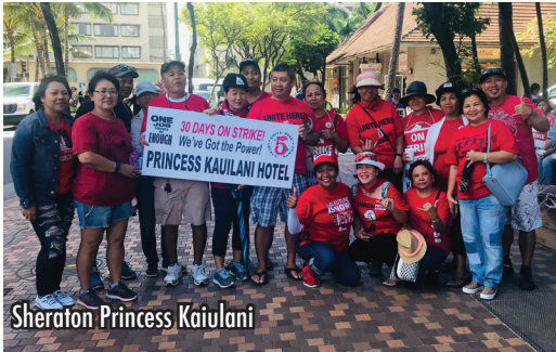
Sheraton Princess Kaiulani