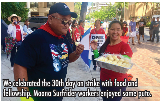
We celebrated the 30th day on strike with food and fellowship. Moana Surfrider workers enjoyed some puto.