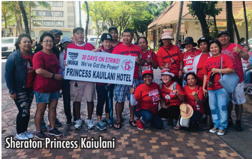
Sheraton Princess Kaiulani