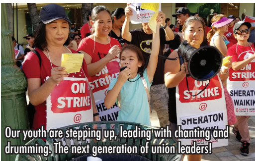
Our youth are stepping up, leading with chanting and drumming. The next generation of union leaders!