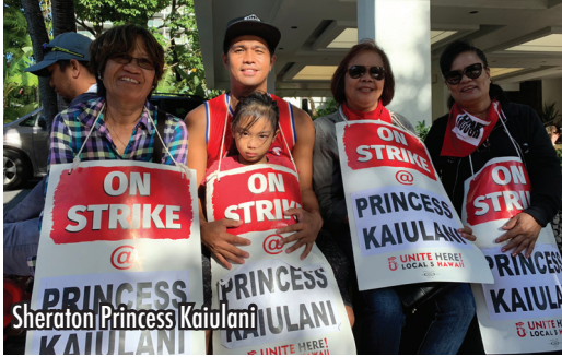
Sheraton Princess Kaiulani