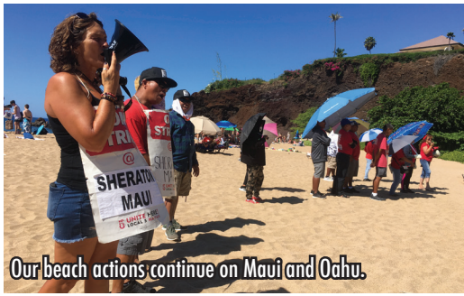
Our beach actions continue on Maui and Oahu.