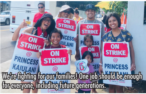
We're fighting for our families! One job should be enough for everyone, including future generations.