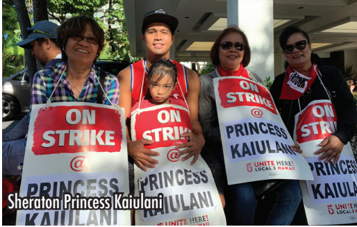
Sheraton Princess Kaiulani