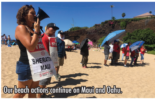
Our beach actions continue on Maui and Oahu.