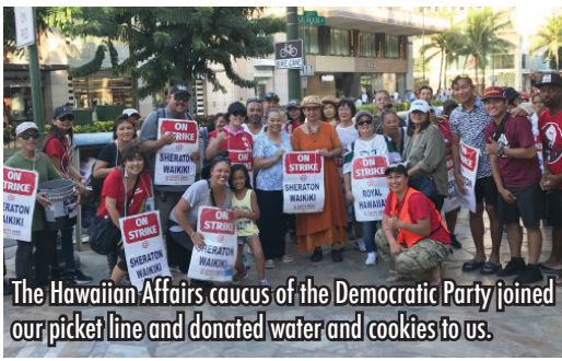
The Hawaiian Affairs caucus of the Democratic Party joined our picket line and donated water and cookies to us.