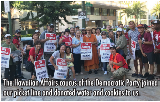
The Hawaiian Affairs caucus of the Democratic Party joined our picket line and donated water and cookies to us.