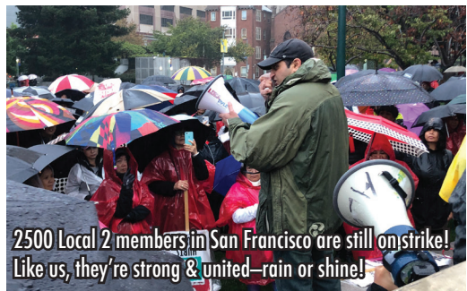
2500 Local 2 members in San Francisco are still on strike! Like us, they're strong & united—rain or shine!