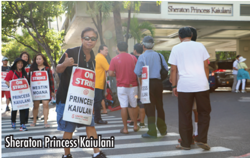
Sheraton Princess Kaiulani