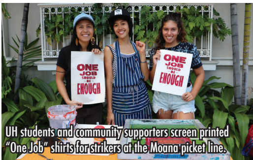
UH students and community supporters screen printed "One Job" shirts for strikers at the Moana picket line.