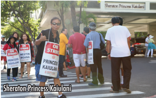
Sheraton Princess Kaiulani