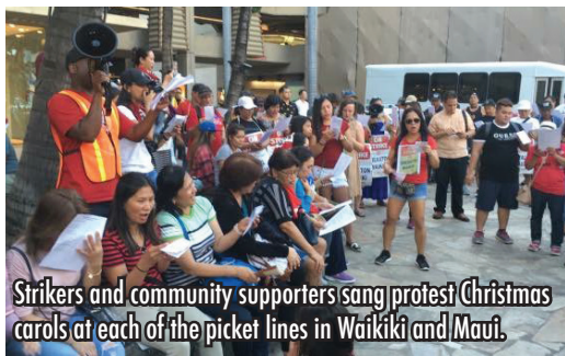
Strikers and community supporters sang protest Christmas carols at each of the picket lines in Waikiki and Maui.